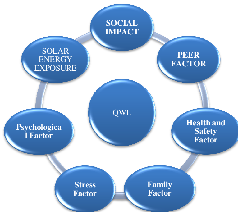
Fig. 1. Depicts factors influencing Quality of Work Life.